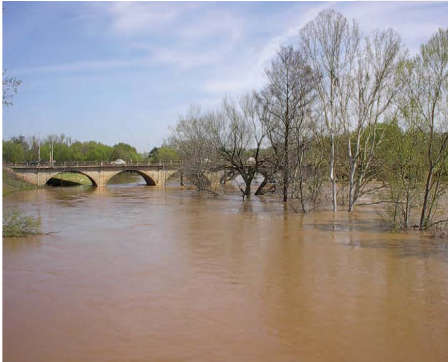
Figure 1 - Broad Avenue Bridge over the Flint River at Albany, Georgia, March 2005, from Musser and Dyar, 2007.

The flood, with a maximum flow of 123,000 cubic feet per second, inundated a large part of the city, caused major losses in property and public infrastructure, and necessitated the evacuation of about 23,000 people (Figure 1). In March, 1998, a second major event also caused substantial flooding, requiring the evacuation of about 14,000 people.