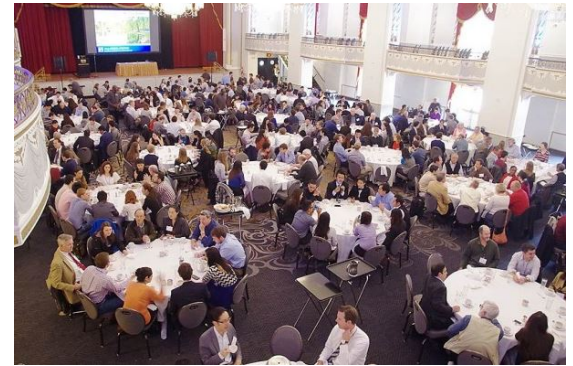
EERI lectures took place throughout the conference at the downtown Boston Park Plaza.

The students were eager during exhibition hours to learn about the Hazus methodology. Ongoing research projects at